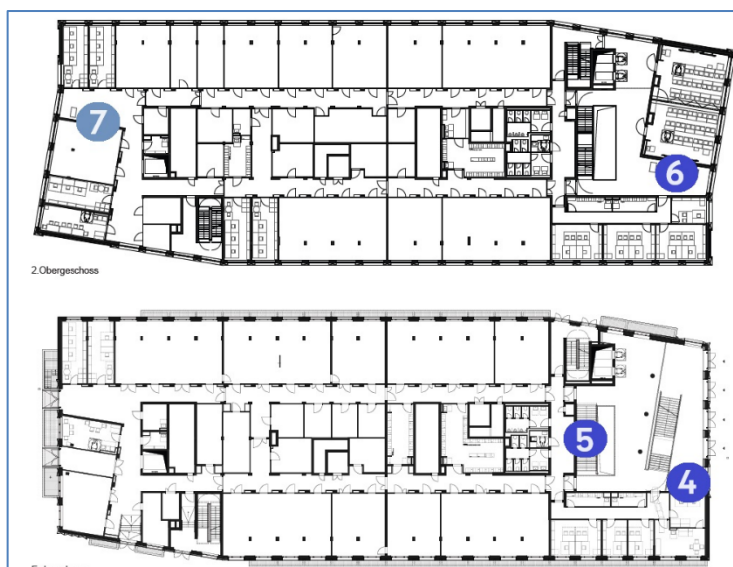
Art locations in the new WAL building: 4. foyer wall main entrance (wall surface above porter's lodge), 5. staircase wall foyer ground floor/basement (cross-floor wall surface), 6. wall surfaces 2nd-4th floor foyer, 7. wall surfaces widening laboratory corridors 1st-4th floor (only in combination with another publicly accessible art location inside the new building)