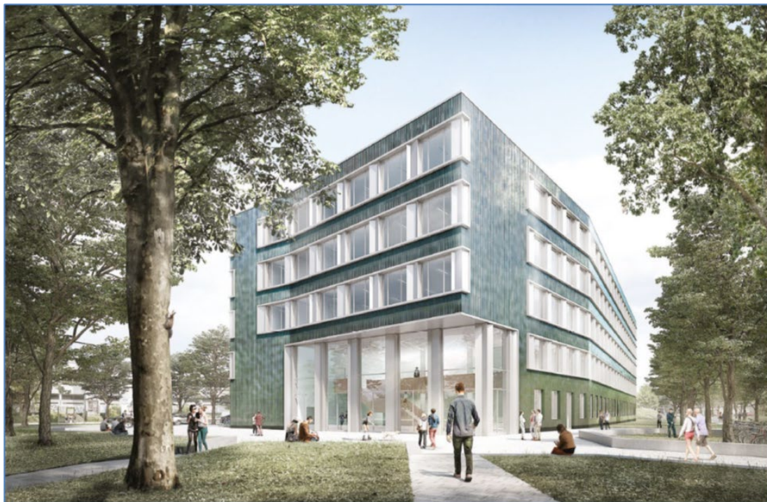
New building WAL, Competition design, exterior perspective

For the new laboratory building WAL (Wedding Advanced Laboratories) of the Berliner Hochschule für Technik, the State of Berlin, represented by the Senate Department for Culture and Social Cohesion, is announcing an open two-phase art-in-architecture competition for professional visual artists and artist groups. A budget of up to 300,000.00 euros incl. VAT is available for the realization of the artwork including all costs for artist's fees, material and production costs as well as incidental costs.